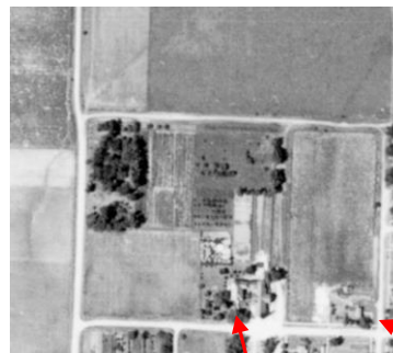
Here's a 1939 aerial view of St. Mary's Church and 305 W Chatham, which is located in the bottom right corner. Both properties were on the edge of town. Note that Tazewell Street ended at St. Mary's.