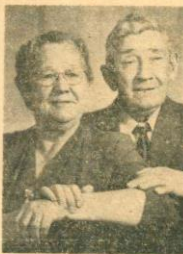
HONORED COUPLE TODAY