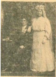
FIFTY YEARS AGO