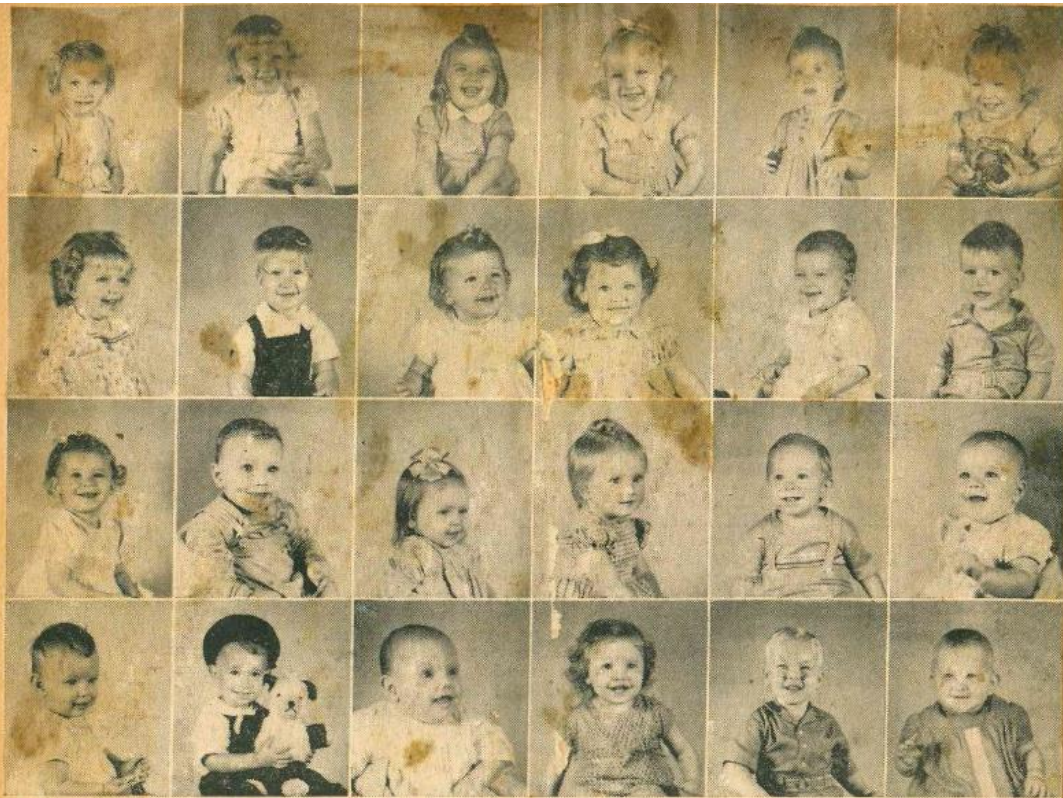
Photos of local boys and girls taken by the Woltz Studios, Des Moines, Ia.