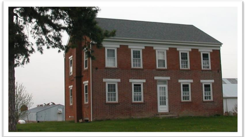
Boys Home - Partridge Point Post Office