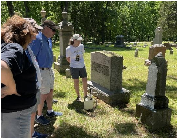
Takes Elbow Grease and Patience!