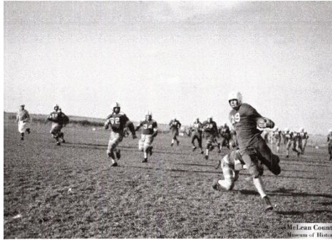
1949 Eureka vs Metamora. Help with names, please!