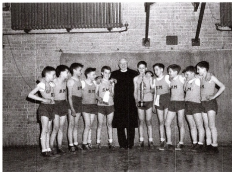
1947 St Mary's Basketball Team – need help with the names!