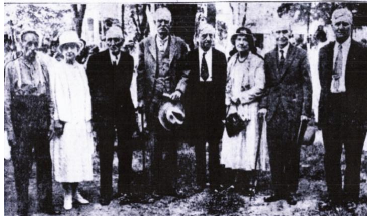
Debates and Court Cases of Emancipator Recalled