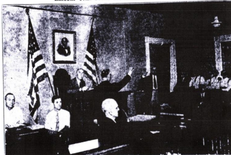
Lincoln Trial Scene Re-Enacted at Metamora